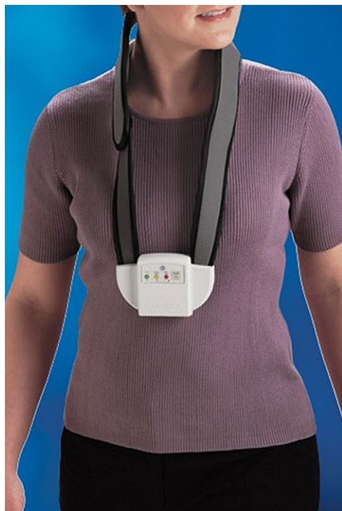
Fig. 1. The Cervical-Stim device.

Postoperative care for both groups was identical. All patients wore a soft cervical collar for 1 week postoperatively. Those randomized to the PEMF stimulation group started within 7 days postoperatively and wore the Cervical-Stim device for 4 hours per day for 3 months (Fig. 1). Follow-