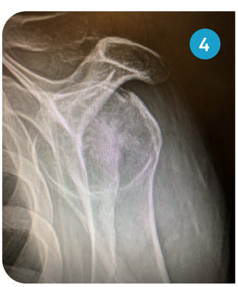
Figure 4. Post-op radiograph demonstrating spread of Tactoset adjacent to anchor tunnel.

Insufficiency fractures in the shoulder after trauma are a significant source of pain. Historically, these patients will have atypical, constant shoulder pain compared to patients with chronic rotator cuff tears.