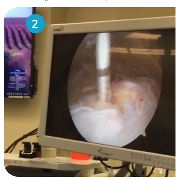
Figure 2. Arthroscopic visualization of cannula placement in the greater tuberosity for the insufficiency fracture.

The side delivery, 11G cannula was used to ensure proper Tactoset placement in the insufficiency fracture for the purposes of pain relief and to augment